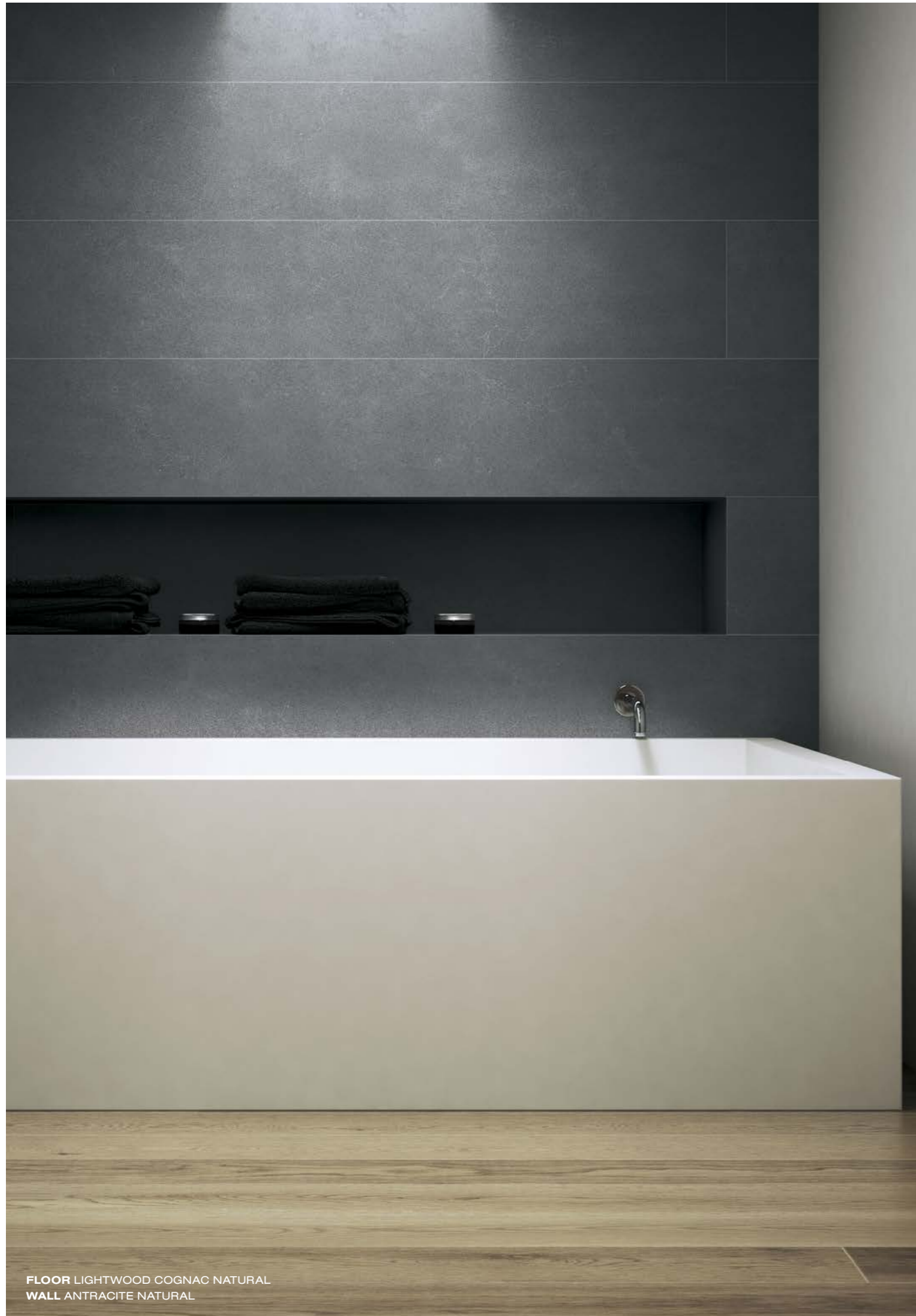
FLOOR LIGHTWOOD COGNAC NATURAL WALL ANTRACITE NATURAL