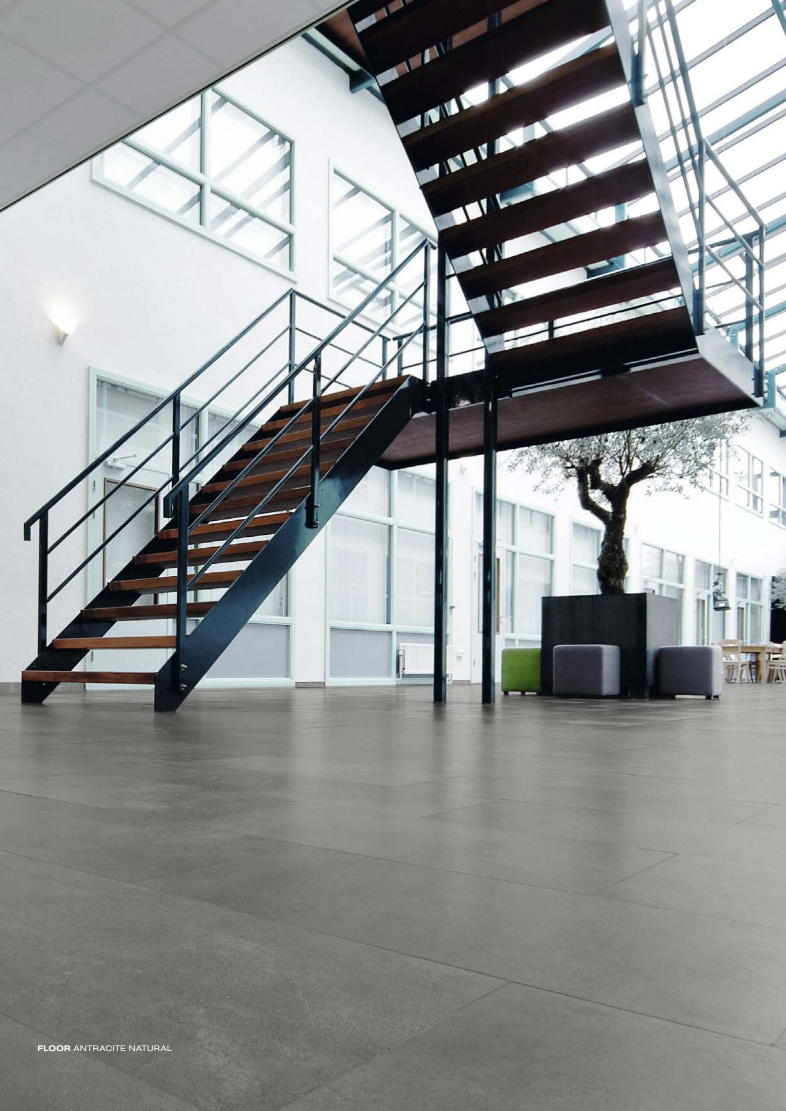
FLOOR ANTRACITE NATURAL