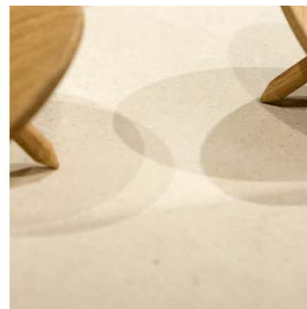
FLOOR LIGHT NATURAL