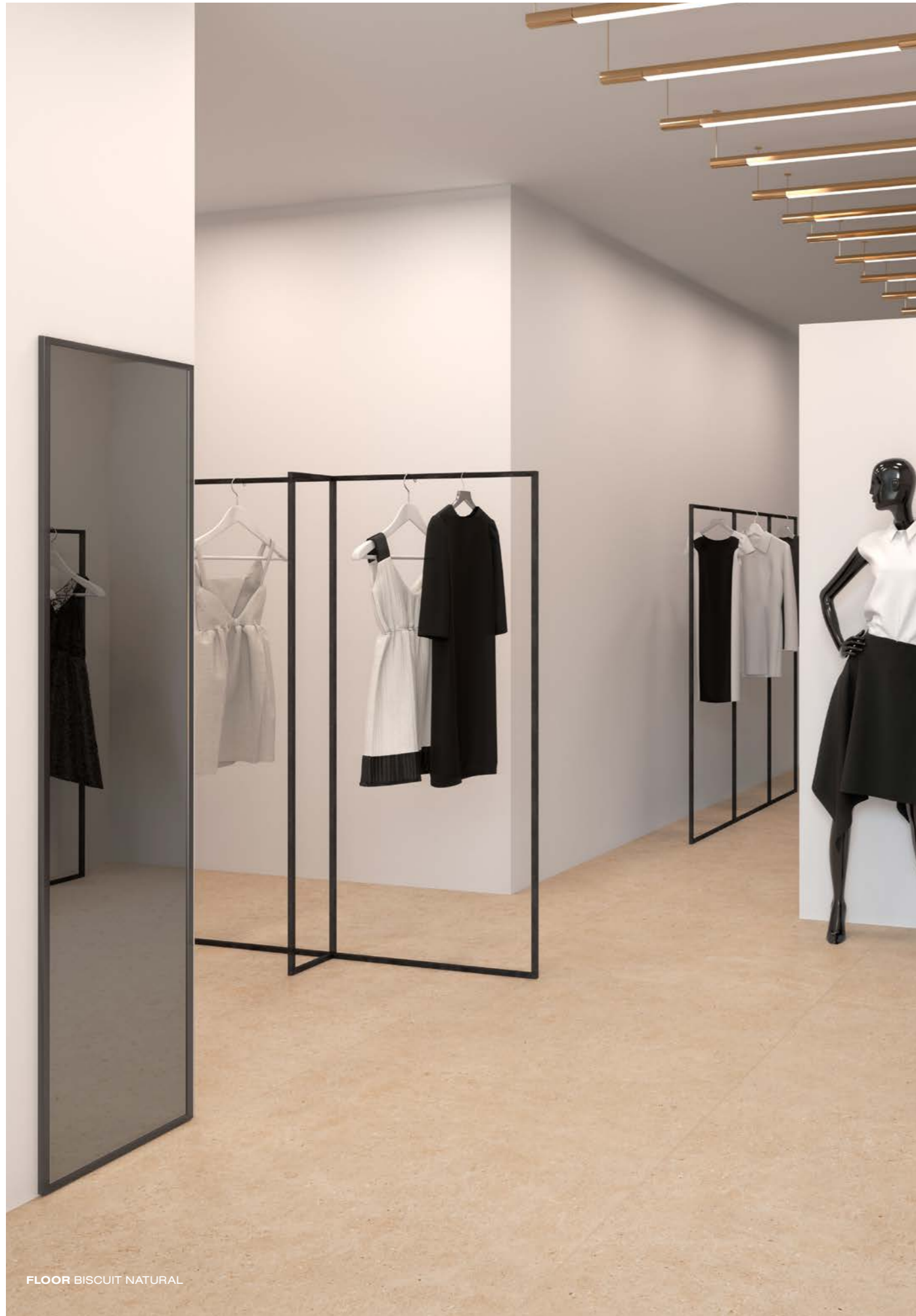
FLOOR BISCUIT NATURAL