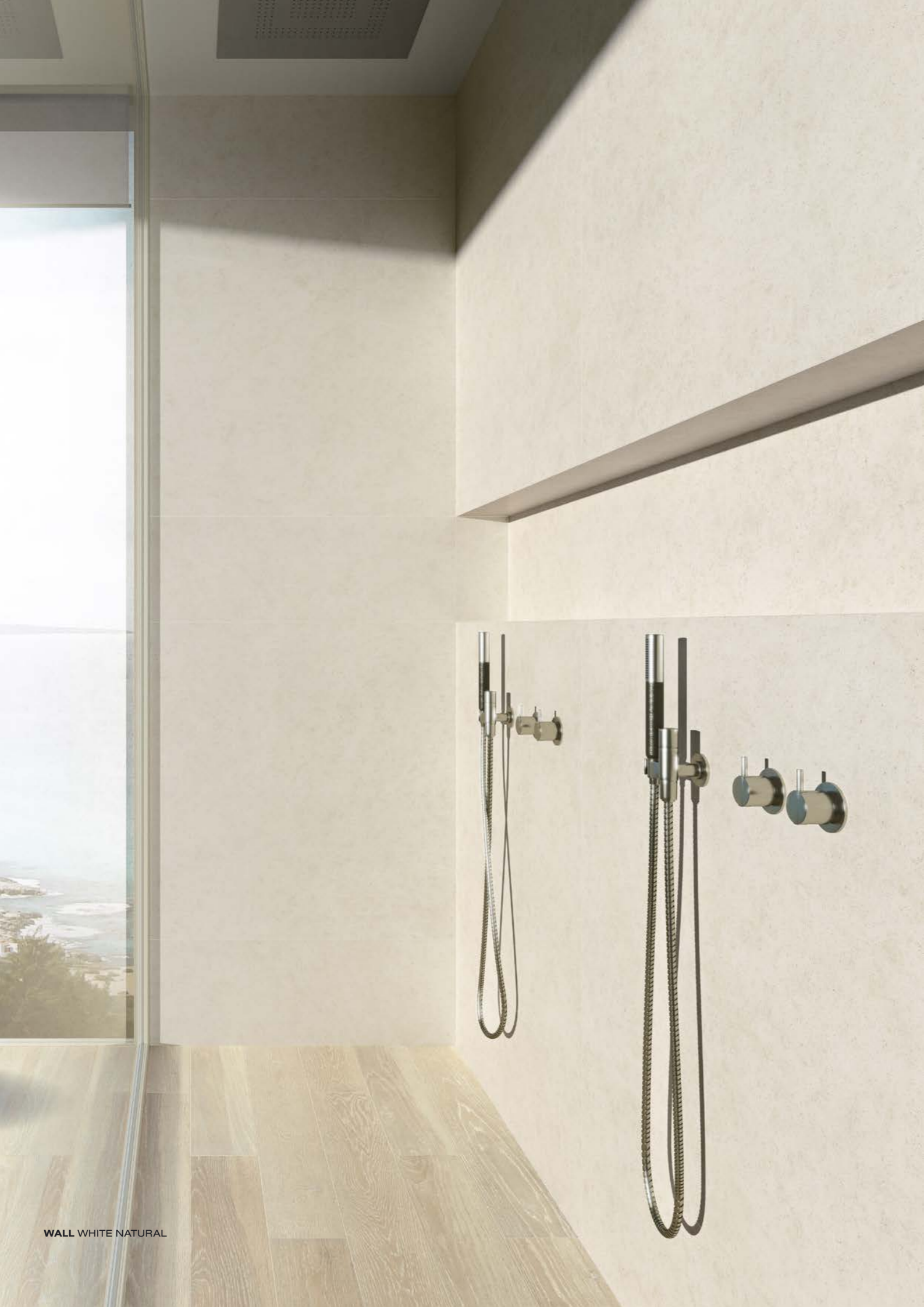
WALL WHITE NATURAL