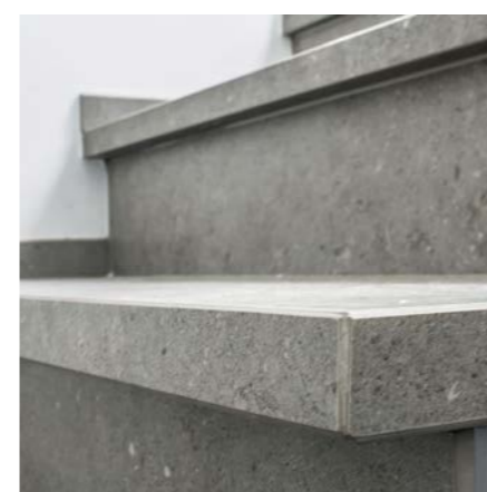
FLOOR DARK GREY NATURAL