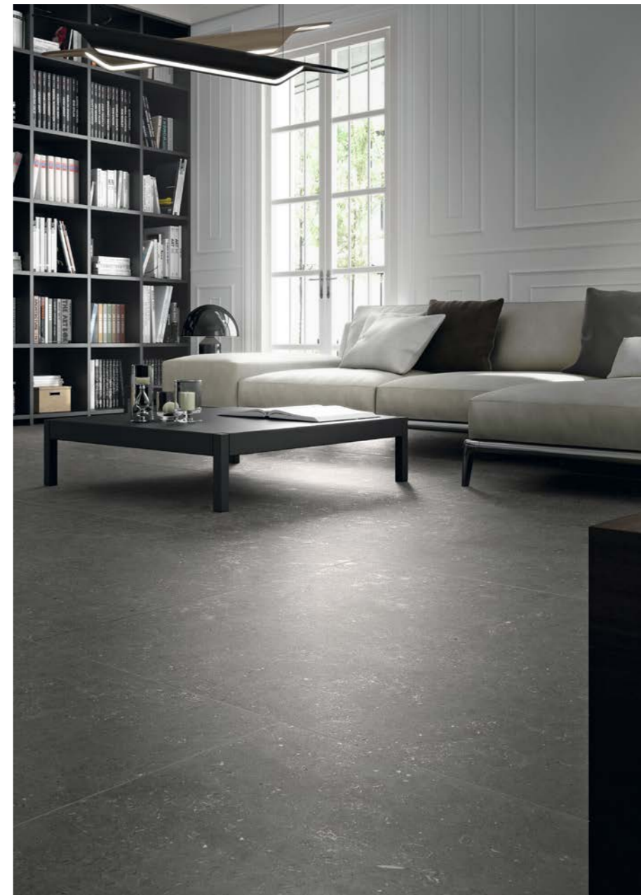
FLOOR COAL NATURAL