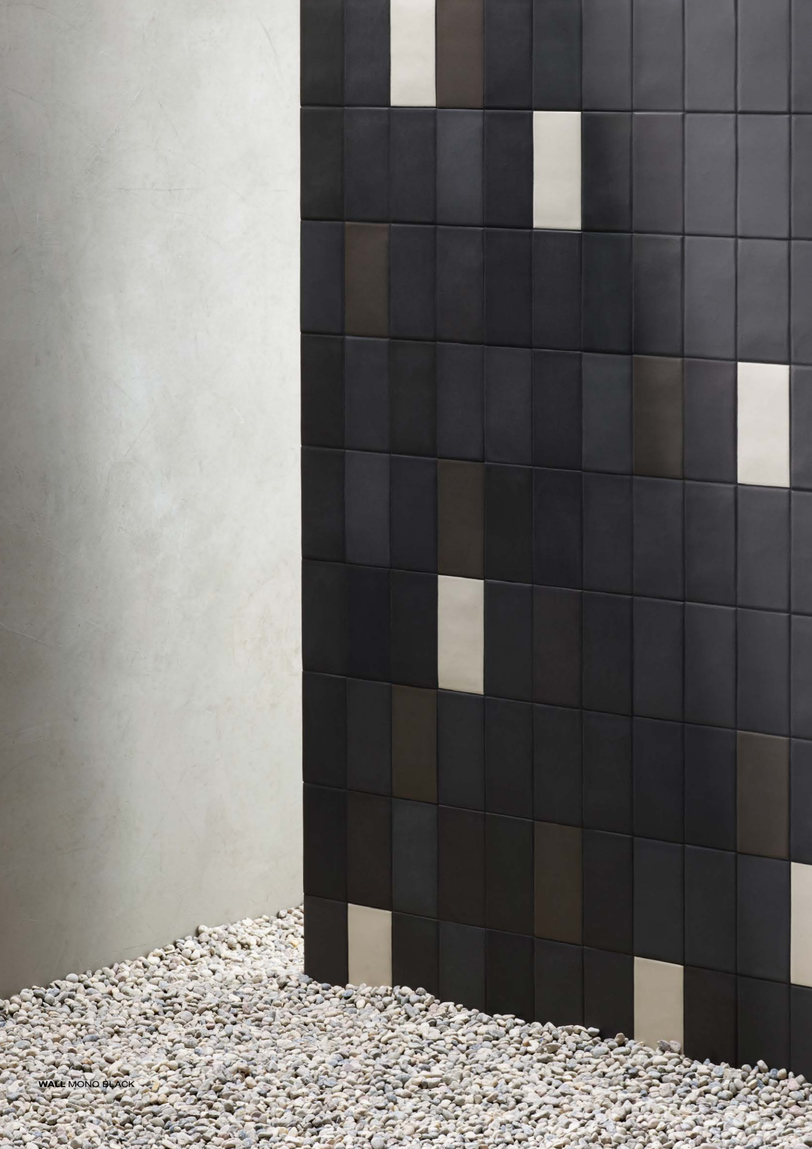
WALL MONO BLACK