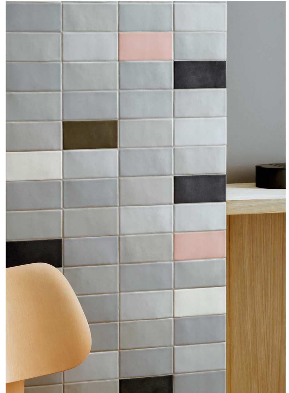
WALL POLY GREY